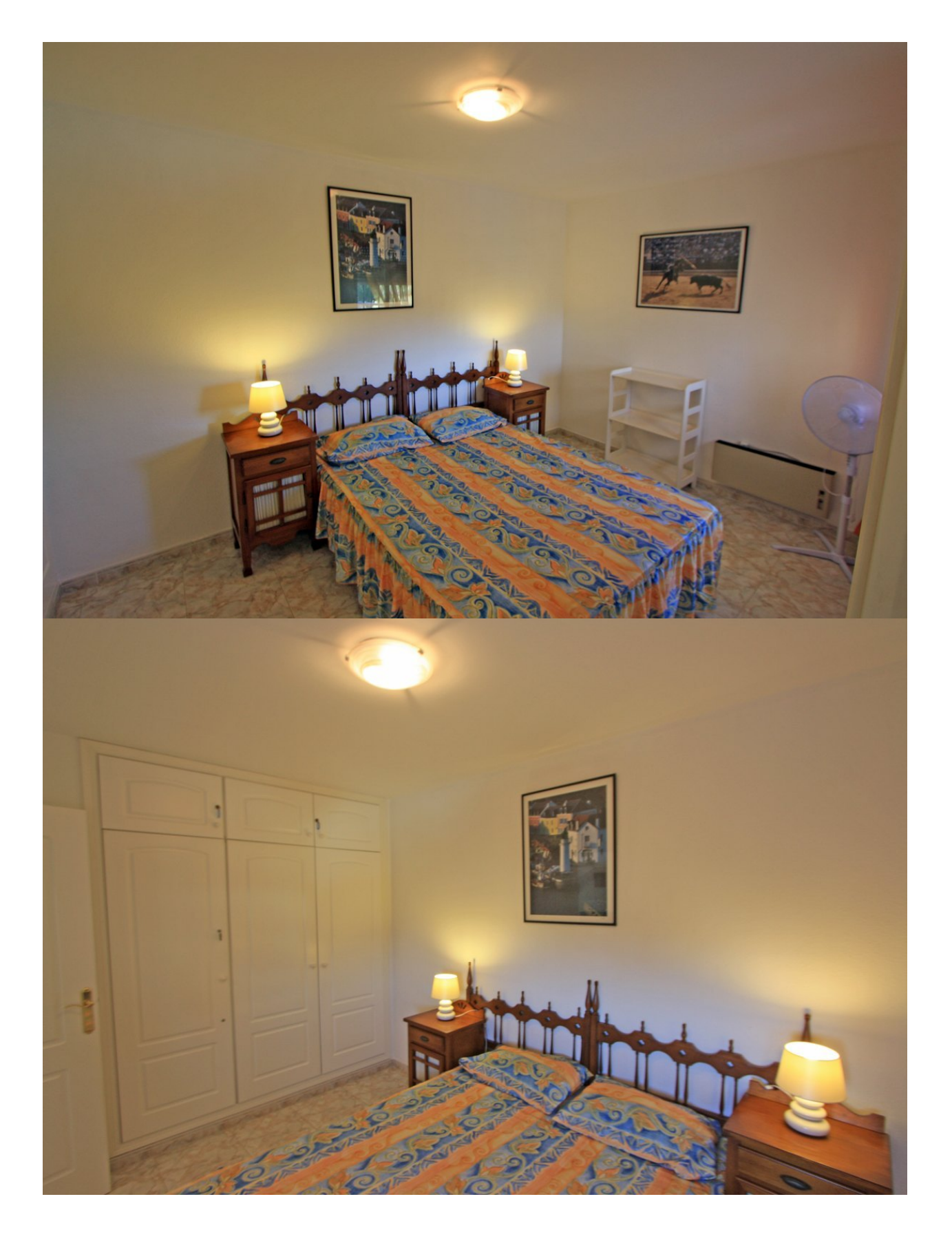
"OUR EXPERIENCE IS YOUR GUARANTEE"