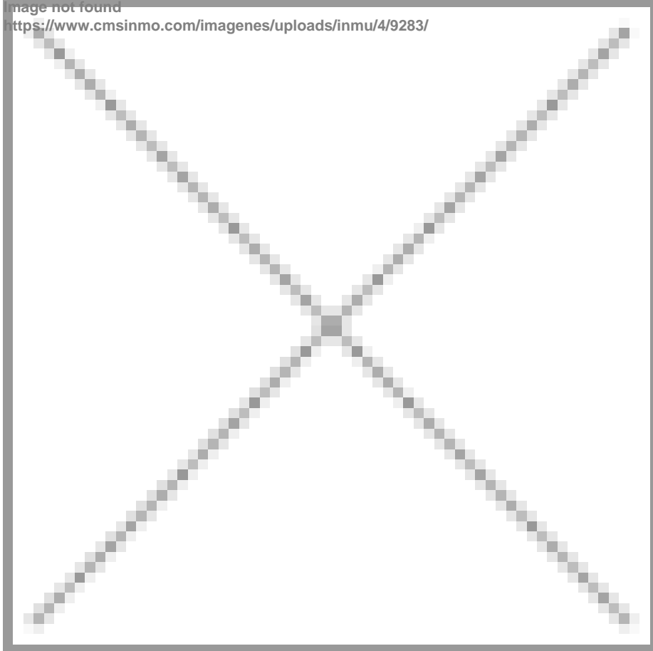
Image not found https://www.cmsinmo.com/imagenes/uploads/inmu/4/9283/